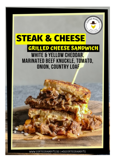
Steak & Cheese ($9) (Country Loaf, Yellow & white cheedar, Salsa, Sliced beef knuckle)