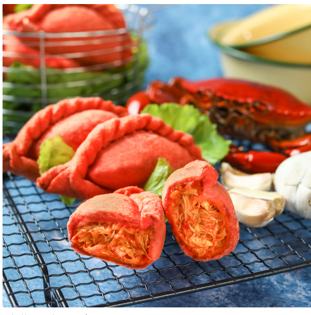
Chilli Crab O', $2 per piece (Seasonal item. Only available at NAO)