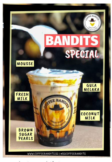
Bandit Special ($6) (A concoction of brown sugar pearls, coconut milk, gula melaka, fresh