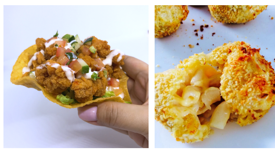
The Travelling C.O.W From left: Truffle Scrambled Eggs Crunchy Taco ($10), Truffle Mac & Cheese Balls ($8)