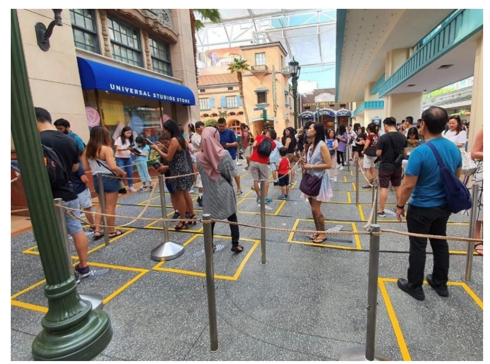
Spaced out queues at Universal Studios Singapore