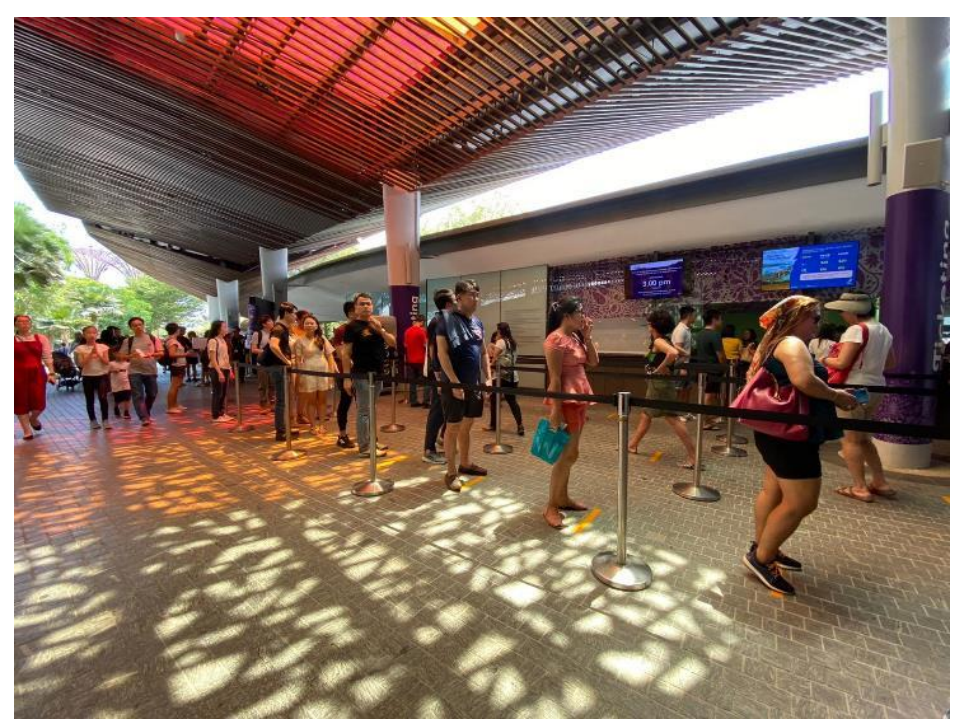
Safe Distancing for queues with use of markers at Gardens by the Bay