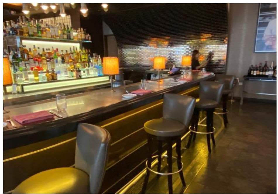
Spaced out counter seating at dining establishment in Marina Bay Sands