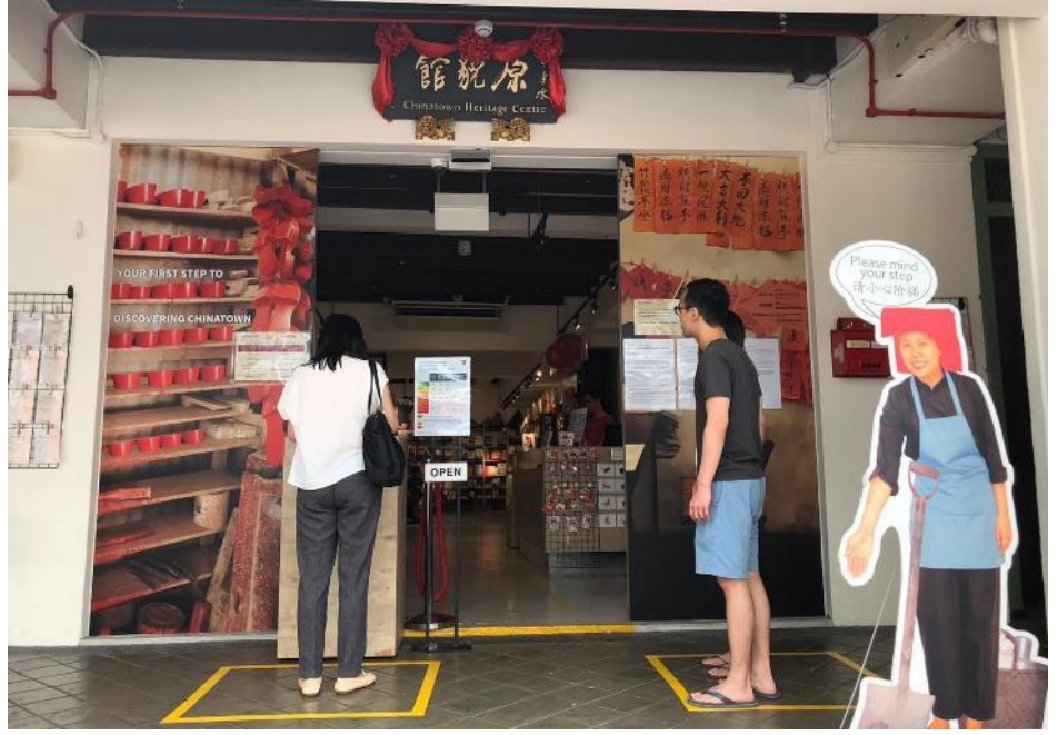
Spaced out queues at Chinatown Heritage Centre