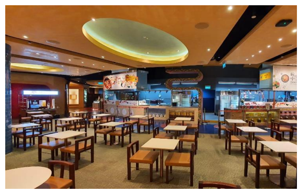
Physically distanced tables and chairs at dining establishment in Resorts World Sentosa